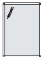
T-A A2 420 x 594 mm