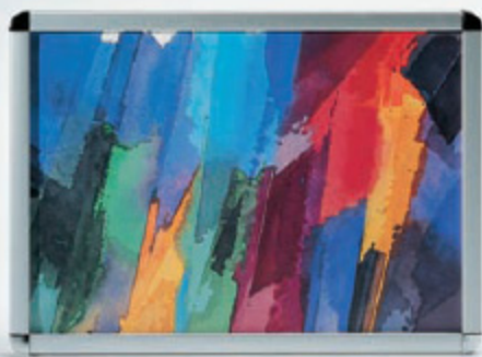
Example type: T-A A1