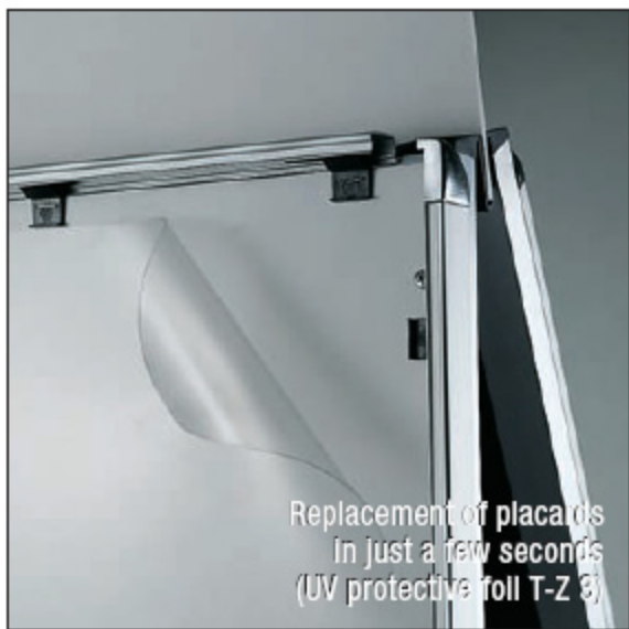
Replacement of placards In just a few seconds (UV protective foil T-Z 3)