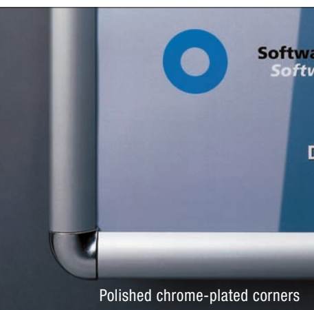
Polished chrome-plated corners

Made for indoor, wall-mounted application, the light box consists of a polystyrene casing and a hinged display frame made of anodized aluminium. Power is supplied via a 2 m cable fitted with a plug. The hinged frame enables graphic material displayed behind the transparent protective sheet to be quickly and easily changed.