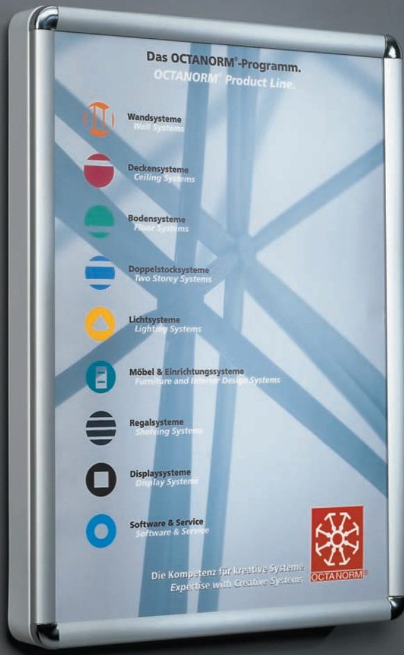
Example type: T-L 1 Panel recommendation: paper placards of the standard size DIN A1

Back-lit presentation of A1-sized graphic material ensures it gets the attention it deserves.