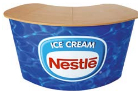
worktop in beech colour