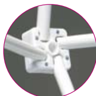
screwed joints for extra durability

Beautiful light-weight counter based upon the tried-and-tested "Expofix" pop-up frame. When combined with, for example, Expofix Prestige, Expostar Magnetic or Ecofix the Counterfix will