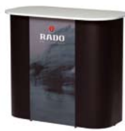
worktop in white