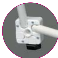
stabilising feet for extra stability