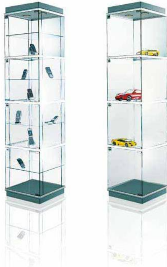
PV-80 & PV-40